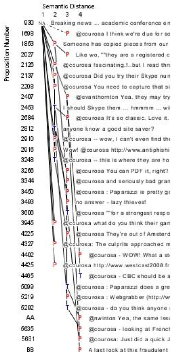
Figure 3. VisualDTA diagram of a conversation with 10 participants

that several simultaneous sub-threads developed. Moreover, while some gradual, diagonal drift is evident, the overall shape of the VisualDTA diagram resembles a set of reactions to an initial prompt more than a collaboratively negotiated, gradually developing conversation. However, even though it is less coherent than the conversation in Figure 2, this group conversation still accomplishes the exchange of information and the collaborative development of ideas.