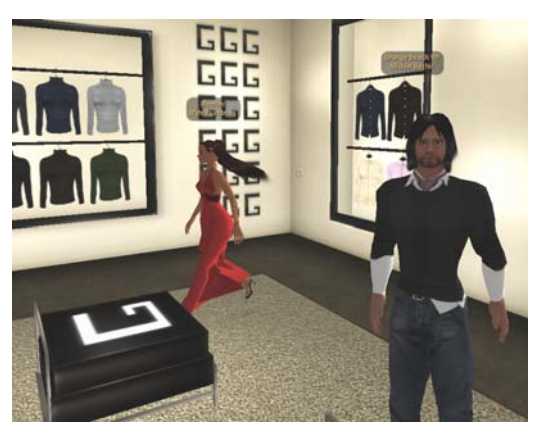
Fig. 3: Clothes shop in SL. A user seeking for eye contact.