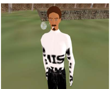
Fig. 9: "MISSING IMAGE" in SL

In SL a missing or damaged picture data of a specific design is automatically replaced by a standard-error-texture. On this picture data, shown as a digital "pattern chart", the message "MISSING IMAGE" is generated on white background (Fig. 9). With his art project Missing Image Aram Bartholl transforms this image (Fig. 10) into a real, skin-tight long sleeve adding gloves (Fig. 11) and transfers it to the physical world. Whereas this graphic error indicates the loss of self-designed identity within SL, Bartholl's work offers means to reflect upon the importance of clothing. In contrast to the clothes created in the Handmade project Missing Image constituted a real object offered at the Ars Electronica exhibition (Pohflepp, 2007).