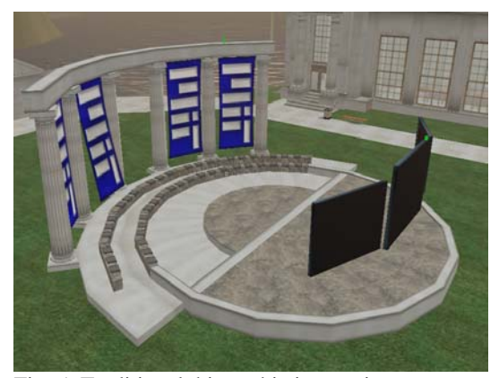
Fig. 5: Traditional, hierarchic instruction space at the MIT campus in SL

Looking at architectural rooms of high schools and universities in SL and concentrating on contemporary needs and issues it becomes obvious, that form (design) follows (its traditional) function in its very sense, which is ex-cathedra teaching with students consuming mainly passively. Thus, information is presented predominantly in ways of language, text, image, video, or 3-dimensional animations. Consequently, innovative learning arrangements are seldom found, such as multi-codal and multi-modal learning, self-directed research and exploring as well as collaborative, topic-oriented, subject-relating learning contextualised according to real, everyday needs. (Figs. 5, 6).