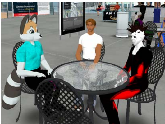
Fig. 4: A Furry, a human, and a mythical creature talking in the collective build "Apfelland"