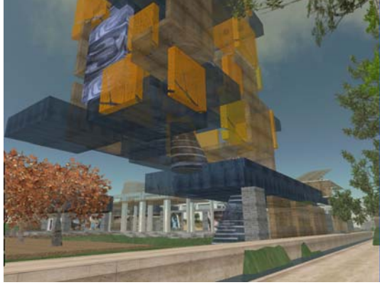
Fig. 2: Imaginative architecture in SL