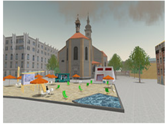
Fig. 7: Baywatch , Pfarrplatz, Linz, Austria