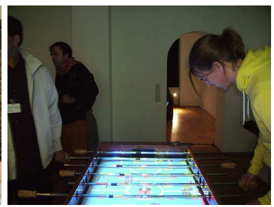
Fig. 12: View of the stadium in Second Life over the shoulder of a player.