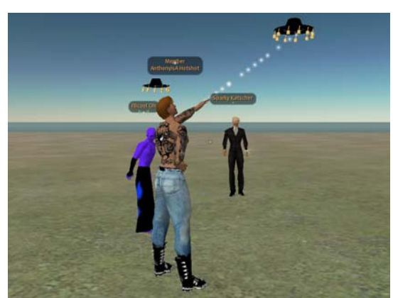
collaboratively in a "sandbox".