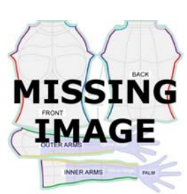
Fig.11: SL image as pattern for print