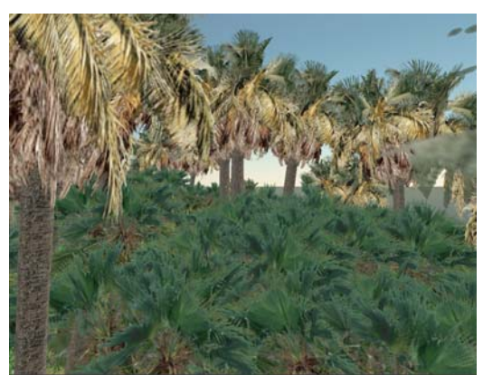
Fig. 1: Scenery developed by WWF in SL

Today SL is a three-dimensional virtual world web with up to 50.000 users at the same time, and more than one million registered users during a time span of 60 days, who are connected simultaneously via the internet worldwide. Since 2003, the Linden Research provides free access to a basic version. In contrast to online computer games such as WOW (World of Warcraft), which attracts nearly 8 million users over a period of 30 days within the United States of America and Europe, SL does not provide a plot or a story leading to a specific goal. Here, the users have choices to create their own virtual life. Whatever the user's goal is - it is up to a user himself respectively herself what to do with one's "second life". SL provides a wide range of possibilities to create and develop one's own virtual world by designing and programming individual objects which constitutes one of SL main assets. Linden's 3-dimensional editor and its programming language Linden-Script provides a wide range of possibilities to define and create the content according to individual goals (Nusch, 2007).