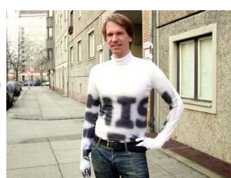
Fig. 10: Missing Image in real-physical space