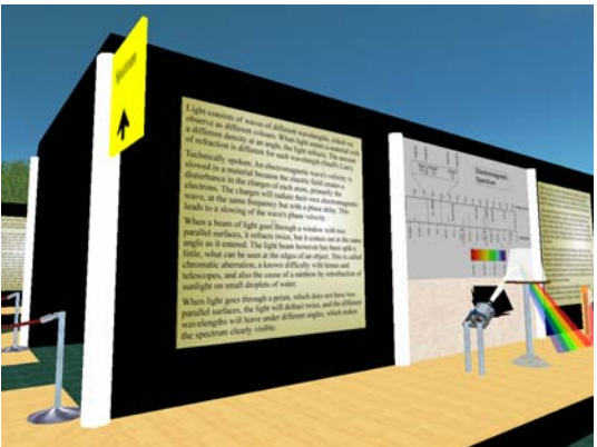
Fig. 6: Science School with text, pictures and animated models.

Contrarily, the sites designed by the users themselves, e.g. the "Apfelland" (land of apples) do match the needs of contemporary learning spaces (arrangements). "Inhabitants" meet up in different combinations with fanciful avatars to communicate in so called "sandboxes" in order to create and apply new objects and scripts.