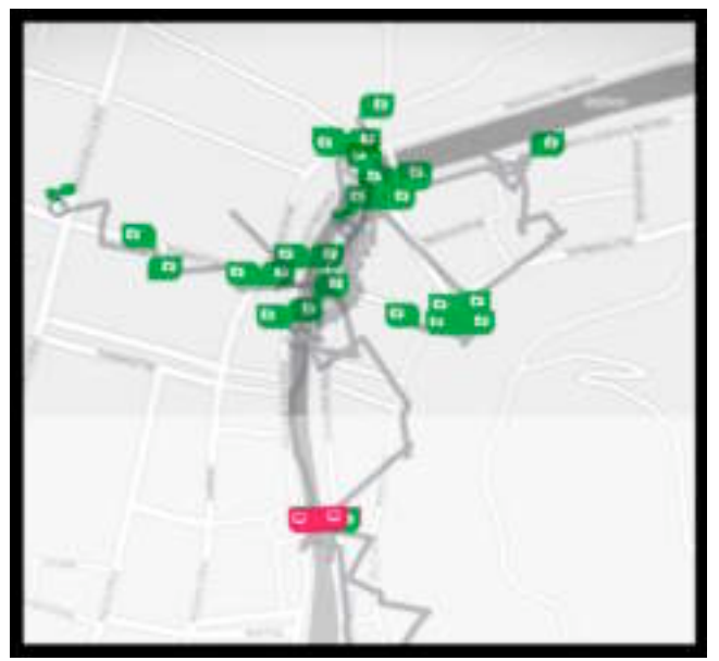
Figure 3: Example of superposed traced stories

The game scenario is developed by linking these clues into a trail, which is visualized as a grey route on the adventure map. Once the game is complete and published to the Guest, they download the adventure route onto their mobile device. The adventure then starts when the Guest answers the Host's starting point question by entering the answer into the mobile interface. If the answer matches the physical landmark where they are located then the first chapter of the adventure is activated.