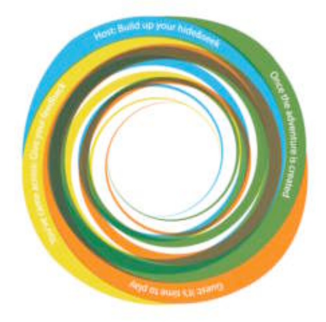
Figure 4: Graphic illustrating the virtuous cycle of host and guest knowledge transfer

Although the proposed workshop use particular technologies, we do not 'live or die' based on these technological frameworks. Moreover, for the proposed workshop, Urban Encounter may call for the use of already existing technology and open source software. In all the cases the used technology aren't prescribing the outcome but rather offering a base where each individuals weave their own practice of the use of these technology. In the end, the product is the stories and the experiment is about the overlapping of these place-based narratives.