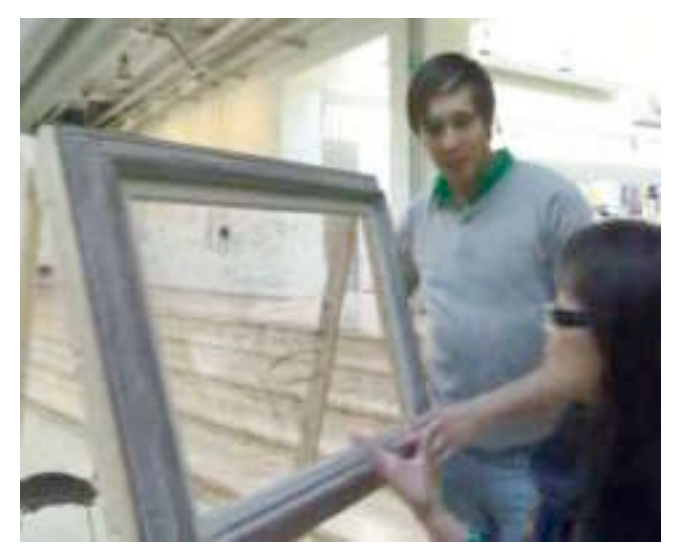
Figure 5: Photo of a portable in space drawing glass.

The use of mobile multimedia technology can sometime be frustrating in the following of a place-specific story and limiting the host creativity. As for example, photos and videos are nearly not visible on most mobile screens under sunny weather while audio offer to possibility to the host to be more prosaic in developing Guest's experience but confusing to orient them. The presented workshop proposes a low-fi experiment at the end of the space exploration that demand each of the 5 host to draw their interpretation of the presented space by using a glass mounted canvas and a set of thick markers [see Fig 5]. Using a language of persuasion, the 5 hosts are one after the other one invited to create a fictional projection of what the framed space "could be". A camera installed over their shoulder film in real time the progression of their drawing over the physical space. Once the 5 host stories are recorded, the workshop author will combine the collected media in a final document that, once more, will serve as material to open the discussion between the workshop participants and generate the "prognosis exchange".